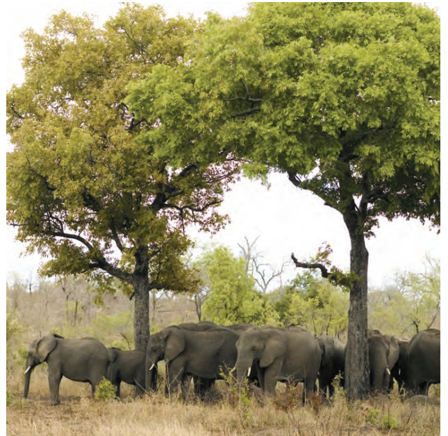
After breakfast we travel through Mpumalanga via Graskop and Long Tom Pass. Enjoy lunch en route (own account).

Note: Optional Full day safari in an open safari vehicle available (own account)