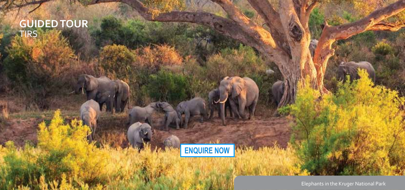
Elephants in the Kruger National Park