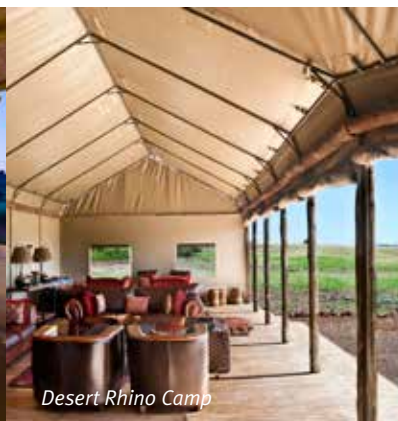
Desert Rhino Camp